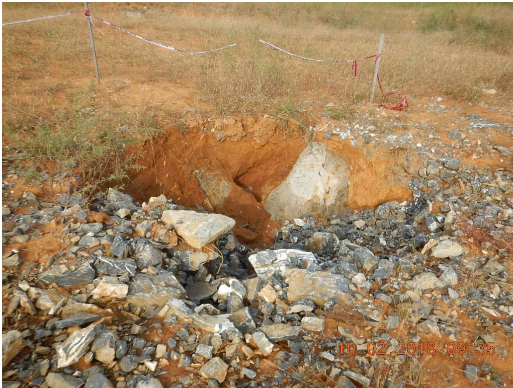
Sinkhole in basin #2.