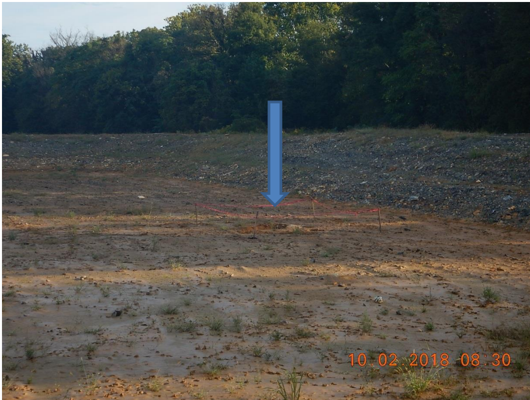
Fifth potential sinkhole pictured in the reuse pond.