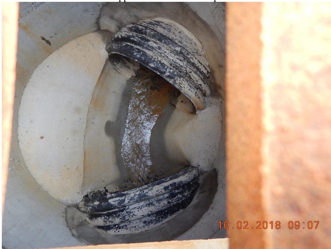
Inside of the drop inlet pictured above of sinkhole #7.