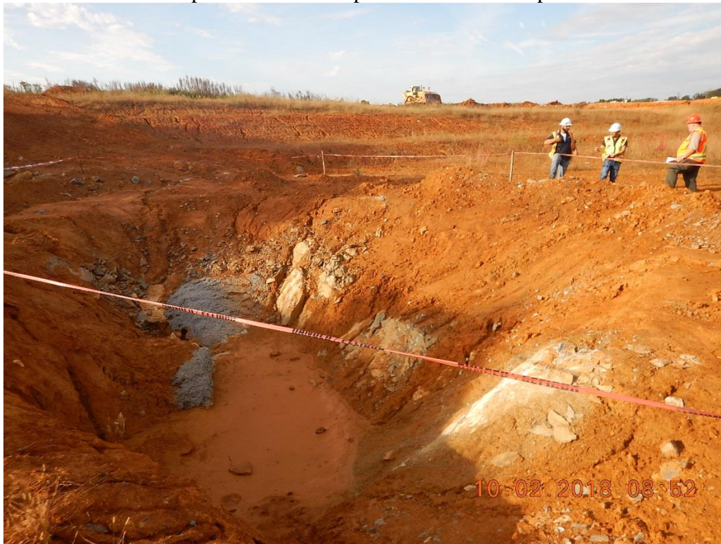
Sinkhole in Basin #1