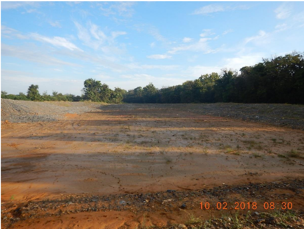
Overview of 5 potential sinkholes in the reuse pond.