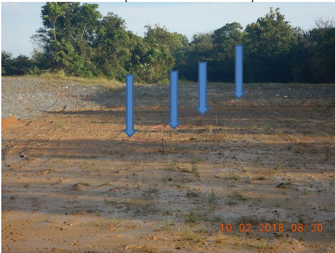
Four sinkholes pictured in the reuse pond.