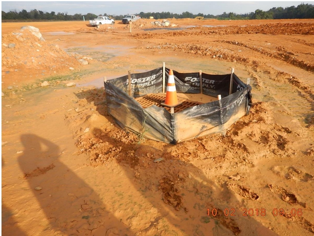
Sinkhole # 7 capped under concrete drop inlet structure.